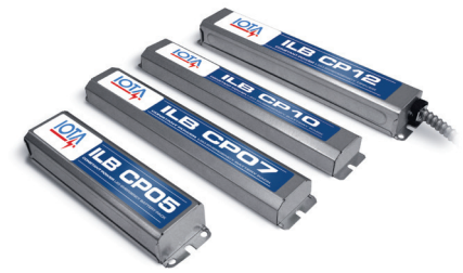
Desired Lumen Output - Constant from Minute 1 to Minute 90

Select the desired lumen output for your fixture's efficacy rating. The shown ILB CP unit will be the minimum wattage unit required. Only general efficacies and lumen values are shown. For specific lumen performance, multiply your fixture's efficacy by the wattage of the desired ILB CP unit. Refer to ILB CP product specification sheets for complete product details.