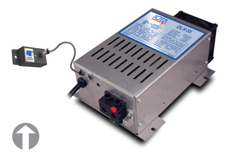
An example of an IOTA DLS charger utilizing an external IQ4 multi-stage charge controller option.

Table A: Typical charging voltages using IOTA IQ4 Charge Control Technology.